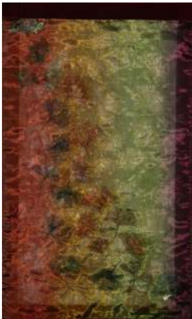
Eileen Neill (Qualicum Beach, BC) Ginkgo - The Living Fossil (38"x22")