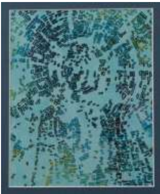
Patricia Long (Aurora, ON) Tree Rings (16.5"x13.5")