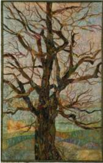
Merilyn J Arms (Boswell, BC) Catalpa - 100 Years Proud (30"x19")