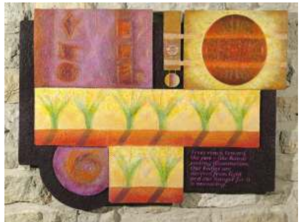
Carol Wiebe (Kitchener, ON) A Feast of Photons (26"x35.5")