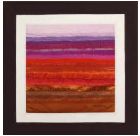
Pat Hertzberg (Mississauga, ON) Big Sky Sunset with Trees (23"x23")