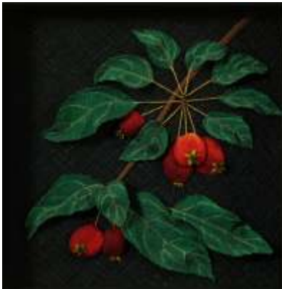
Tracey Lawko (Toronto, ON) Crabapple Branch (13"x13")