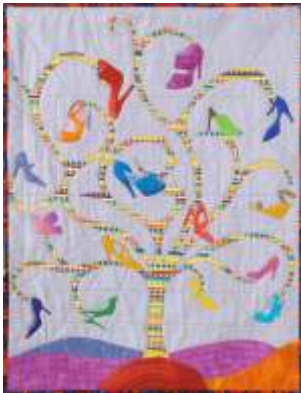
Nancy McNab (Rockwood, ON) Shoe Tree (25"x18")