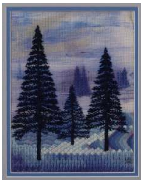
Anne Condie (Toronto, ON) Northern Blues (15.5"x13")