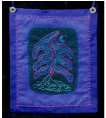
Lorraine Vella (Thunder Bay, ON) Portrait of the Soul of our Tree (21"x16")