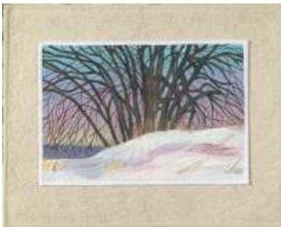
Beverly A White Winter Sunset at Gerry's Fries (16"x20")