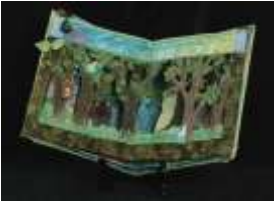
Tia Bourne Mushka (Cambridge, ON) Finding the Things I Lost in the Forest (14"x12"x5")