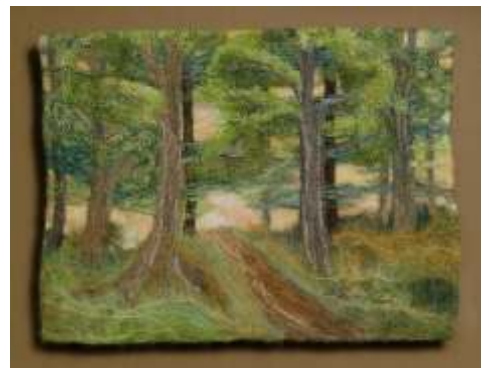
Laura Trach (Minden, ON) Finding the Way , 13"x17")