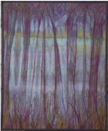
Penny Berens (Granville Ferry, NS) Trees Standing Tall at Midnight (20"x26.5")