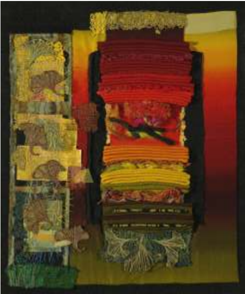
Kiyomi Sakamoto (Toronto, ON) Dead Ends (26"x21")