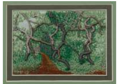
Marcella Pedersen (Cut Knife, SK) Crooked Trees in 1999 at Speers, SK (8.5" x 10")