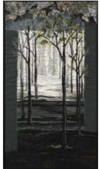
Heike Blohm (Newmarket, ON) A New Beginning (29"x17"x2")