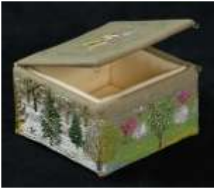
Dell Walker (Ottawa, ON) A Box of Trees (2.75"x4"x4")