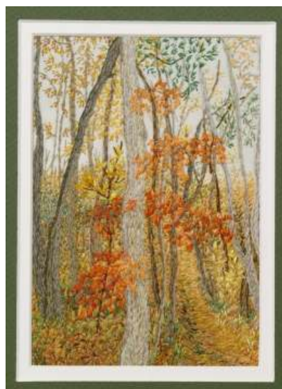
Maureen Byer (Kingston, ON) The Trail (10"x8")