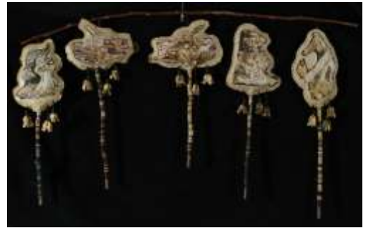
Sybil Rampen (Oakville, ON) Tree Root Puppets (20"x40")