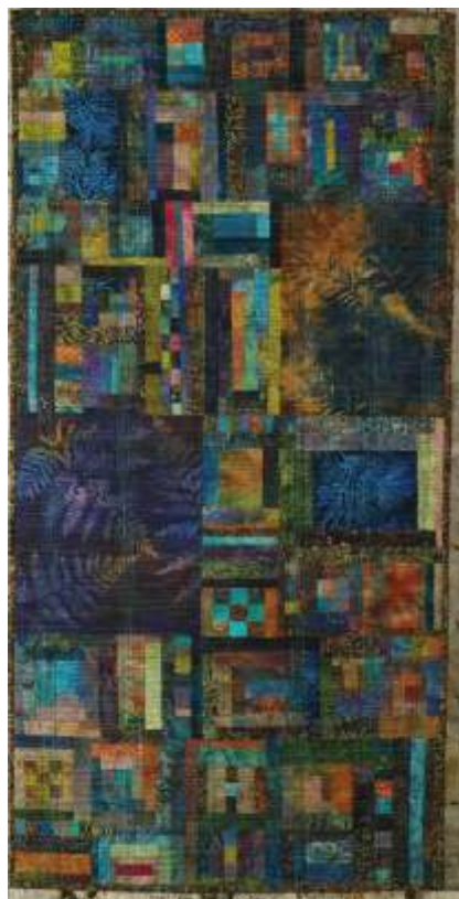
Bethany Garner (Elginburg, ON) Understory (48"x24")