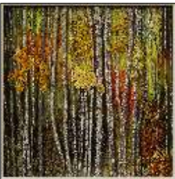
Penny Milton (Toronto, ON) Autumn Aspens (7"x7")